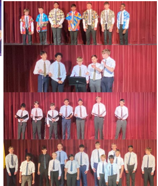
The Winners – Stamford House