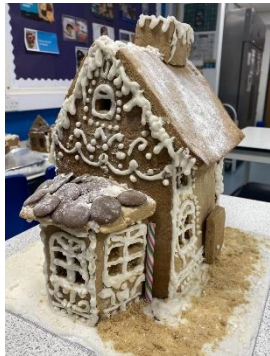
(Left) Owais B (10MK) - Stamford

Special congratulations go to the two pupils from Year 7 and Year 8 who made gingerbread houses that had some wonderful detail, like a woodstack at the side and a gingerbread man to live in the house!