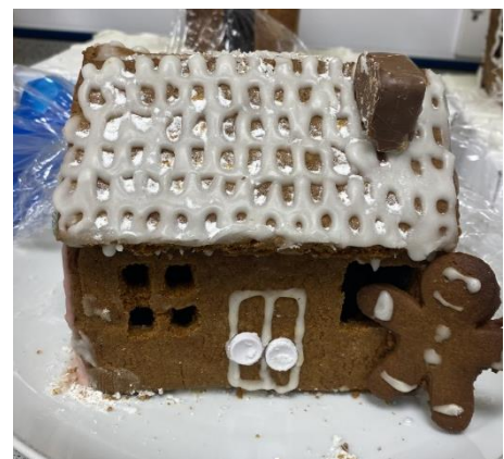
(Right) Yusuf J (8CC) – Stamford

Well done to everyone who took part – I hope you now