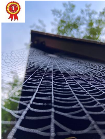
1 st - Caleb C (13CN) Massey (Left)