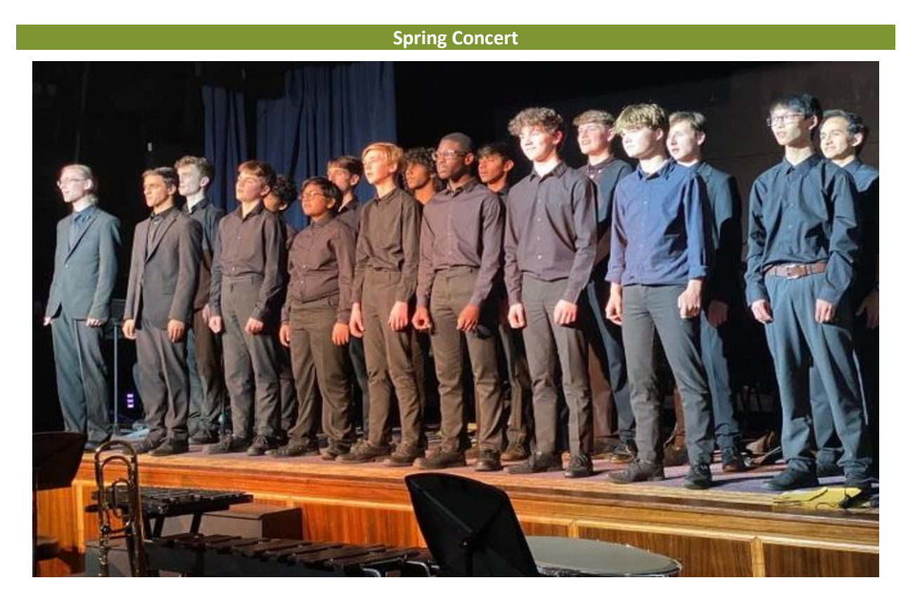
What a fabulous evening we had on Wednesday this week which featured almost every ensemble the Music Department runs – from Jazz, Wind, Concert Band to Choirs and lots of musical theatre numbers. Fabulous performances from everyone, what a night!

What great weather our Year 11 Geographers had this week for their trip to Ancoats to assess the sustainability of the regeneration. Many thanks to the Geography Department for organising.