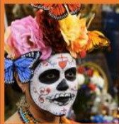
Day of the Dead Skull – Mexican Culture