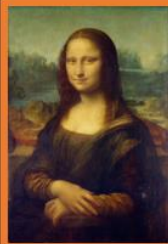
'Mona Lisa' 1503 by Leonardo Da Vinci